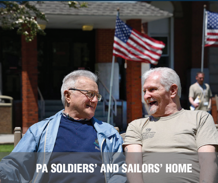
PA SOLDIERS' AND SAILORS' HOME