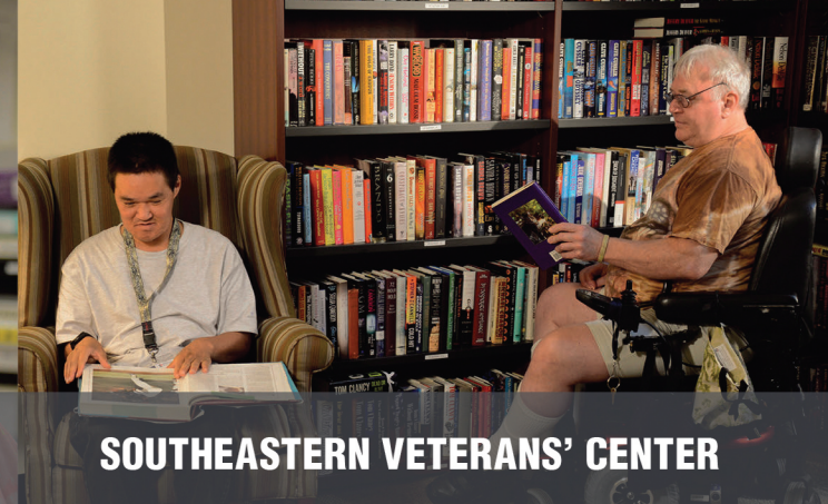
SOUTHEASTERN VETERANS' CENTER