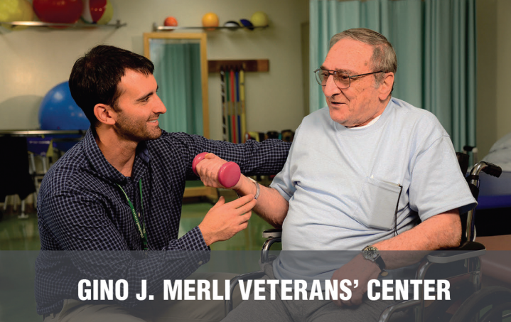
GINO J. MERLI VETERANS' CENTER